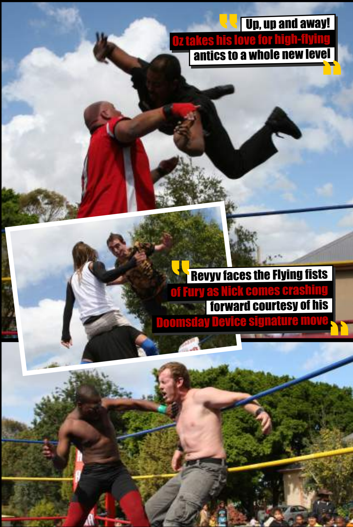
Up, up and away! Oz takes his love for high-flying antics to a whole new level